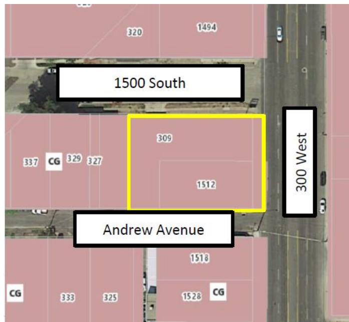
Figure 1 (Location of proposed project PLNPCM2022-1154)